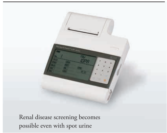
Renal disease screening becomes possible even with spot urine