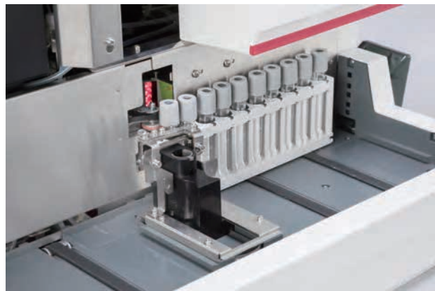
Identified as a set

Pair rack can have a barcode labeled-sample tube and a sample cup identified as a pair, contributing to safety aspects by preventing mix-up and streamlined work flow.